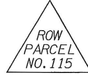
EXHIBIT "A" 15-09-201-017 1365 W.TIENKEN RD.