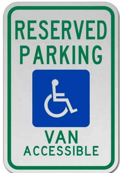
HANDICAP PARKING SIGN DETAIL

NOTES: BENCHMARK #401 NAD88 AT HYD ARROW ELEV.=717.14 BENCHMARK #491 NAD88 AT HYD ARROW ELEV.=717.48