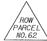
EXHIBIT "A" 15-07-226-005 NO ADDRESS AVAILABLE