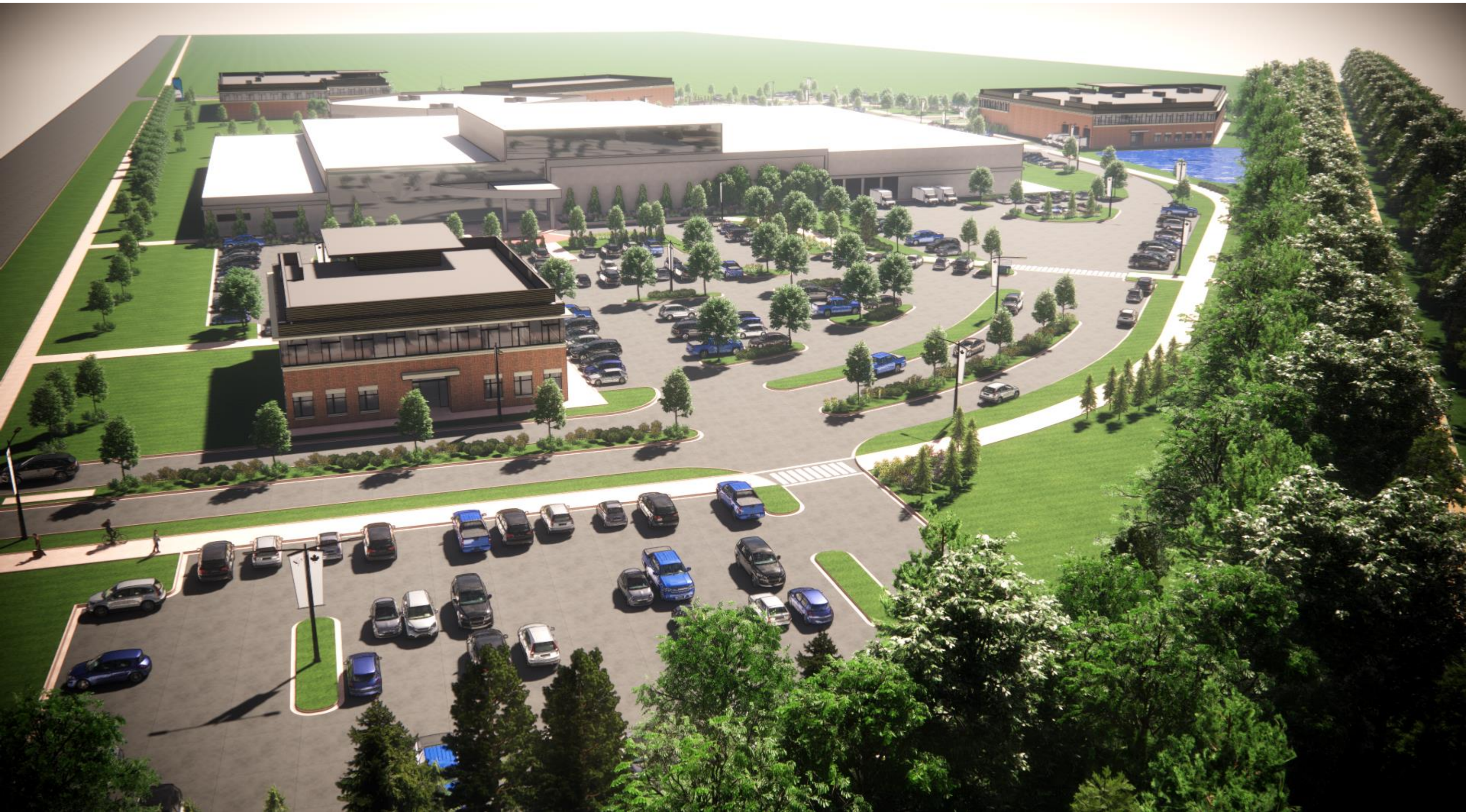
CLOSE AERIAL ILLUSTRATION