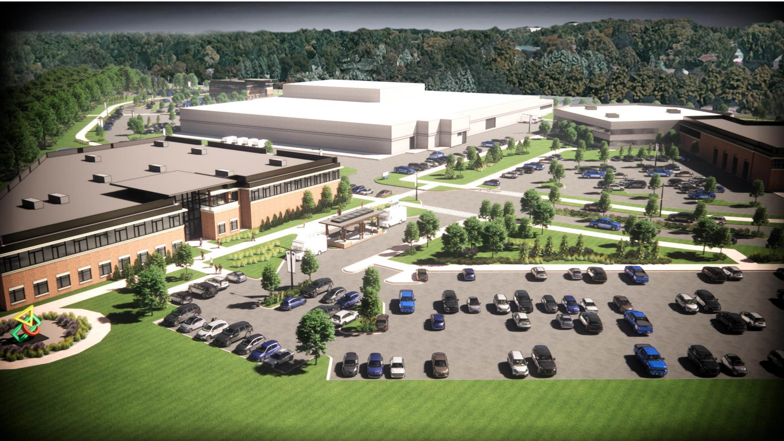
CLOSE AERIAL ILLUSTRATION