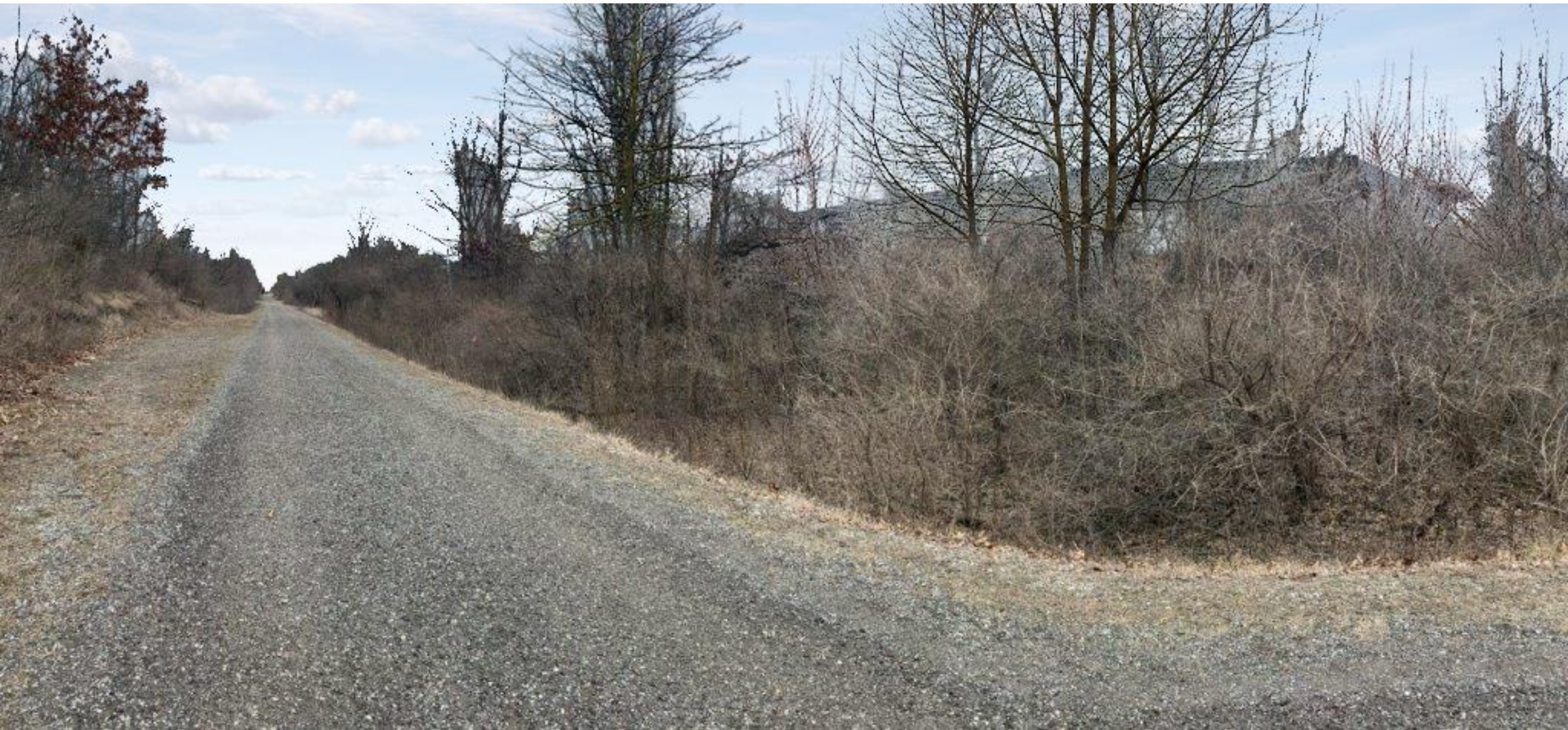
VIEW OF BUILDING 5 FROM TRAIL