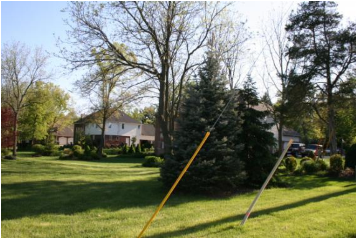
Houses to the southwest of 1631 W. Avon Road, May 2012