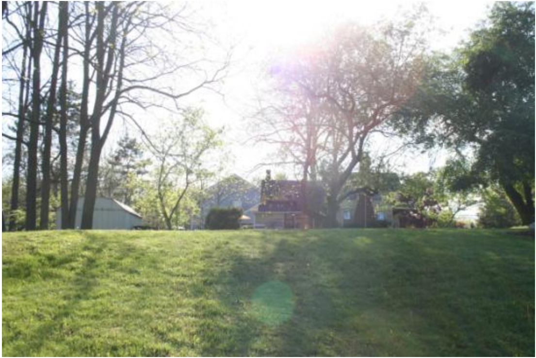
Looking west at 1631 W. Avon Road, non-historic shed to left, May 2012