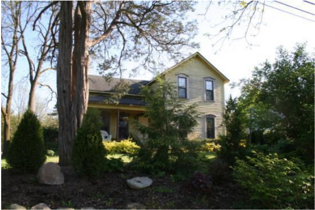
Looking southwest at 1631 W. Avon Road, May 2012