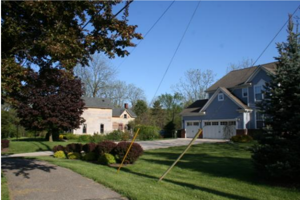
Looking east at 1651 and 1631 W. Avon Road, May 2012