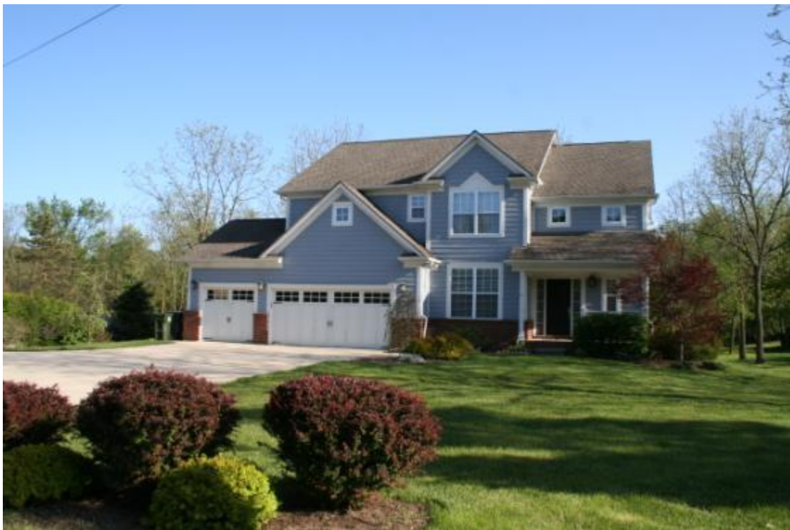
Looking south at 1651 W. Avon Road, constructed 2004, May 2012