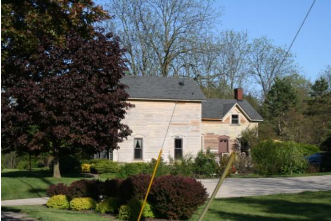
Looking east at 1631 W. Avon Road, May 2012