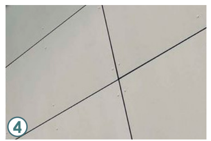
FIBER CEMENT PANELS