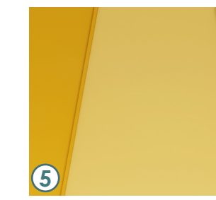
PAINTED FIBER CEMENT PANELS W/ PAINT-ABLE METAL REVEALS