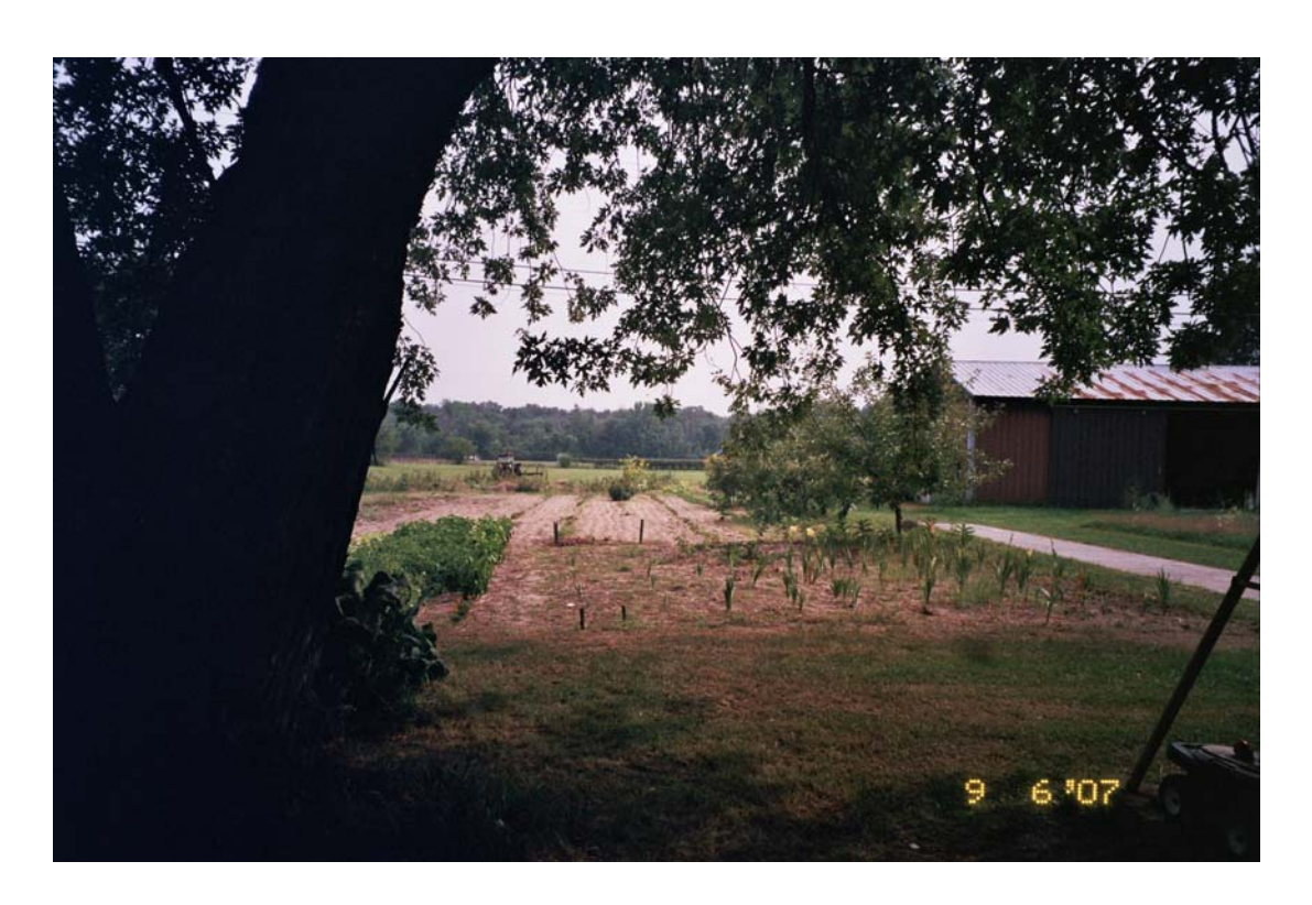
Photo 8. View south from behind Ray Frank House. Pole barn on right.