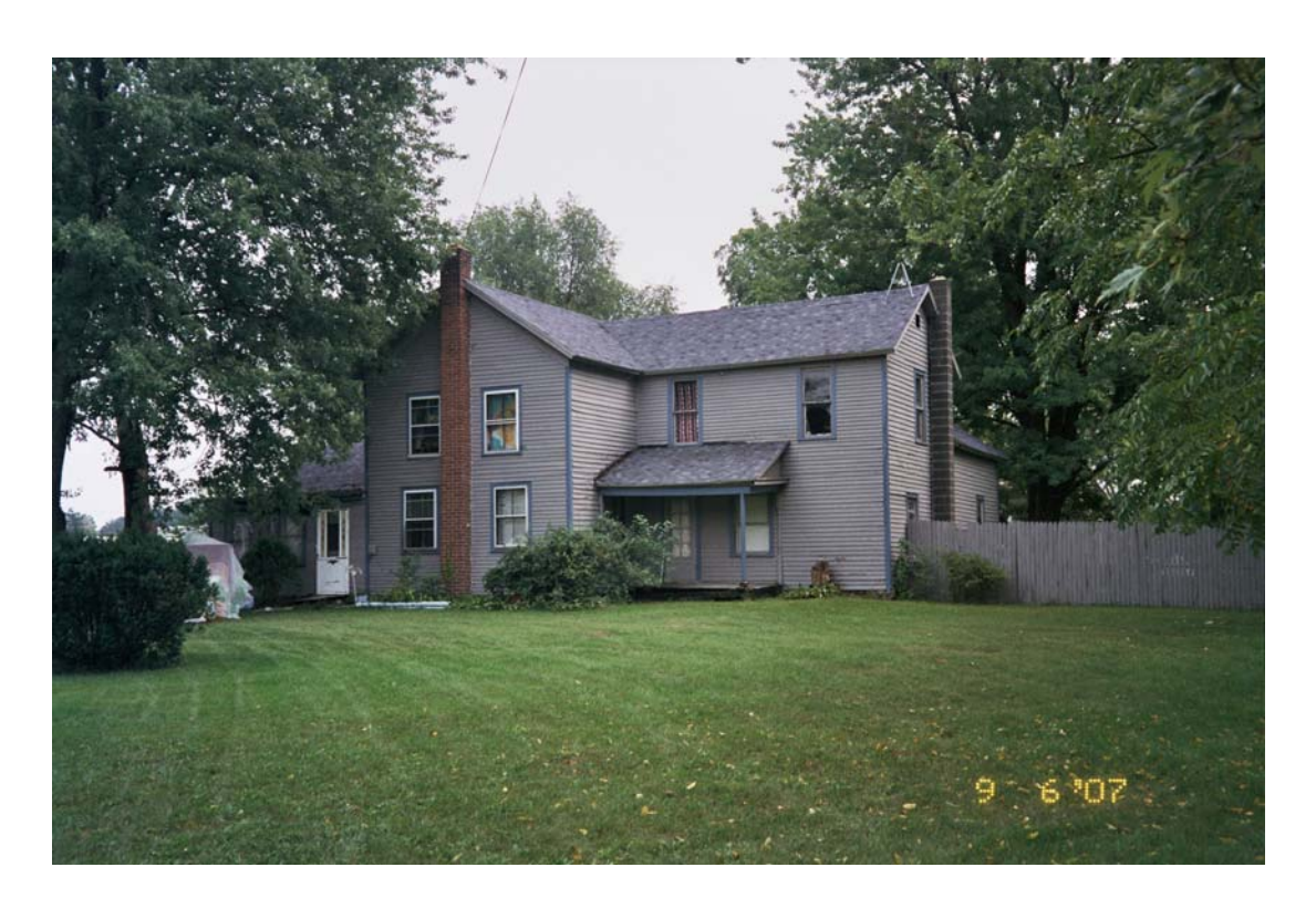
Photo 2. Lucius L. Frank House, 1304 E. Auburn Road, looking southeast.