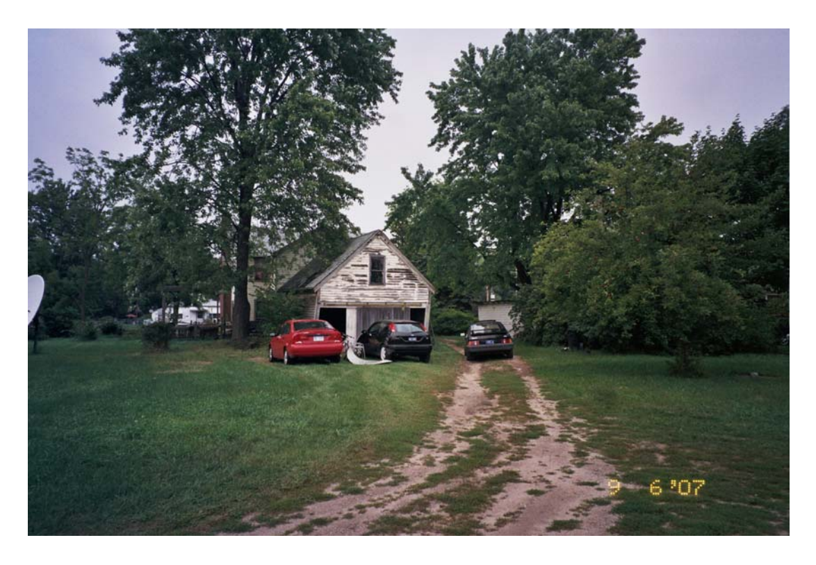
Photo 7. Loren Frank House garage, looking northeast. Milk house visible on right.