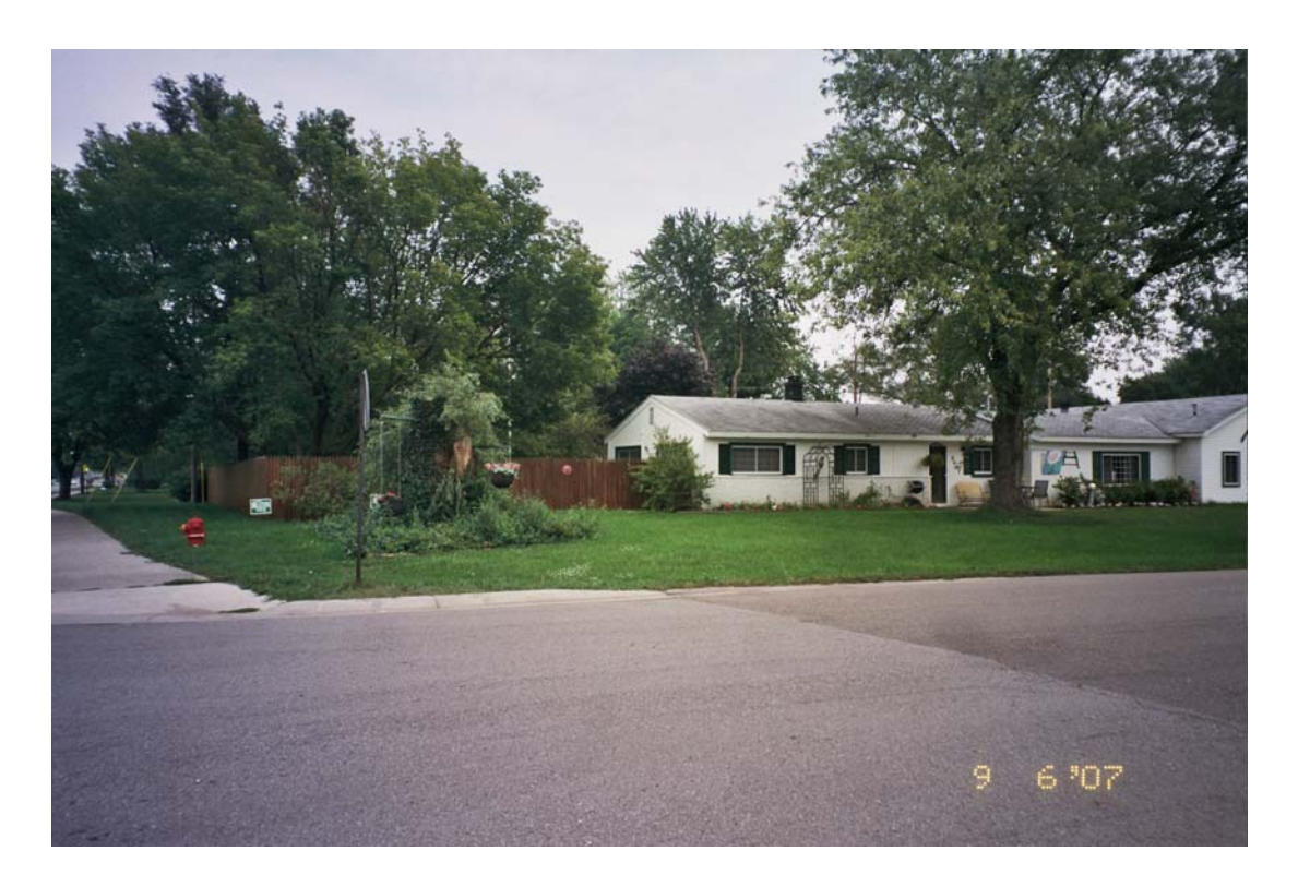
Photo 11. Avon Manor Estates subdivision, corner of John R. and East Auburn roads, looking southeast.