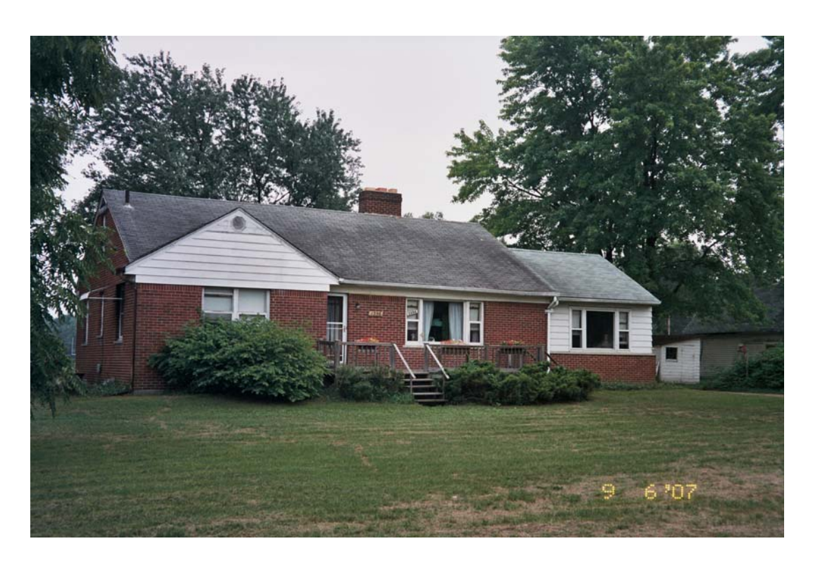
Photo 4. Ray B. Frank House, 1356 E. Auburn Road, looking southwest. Milk house visible on right.