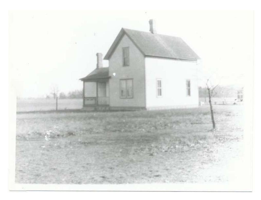
Figure 3. Loren B. Frank House, 1916.