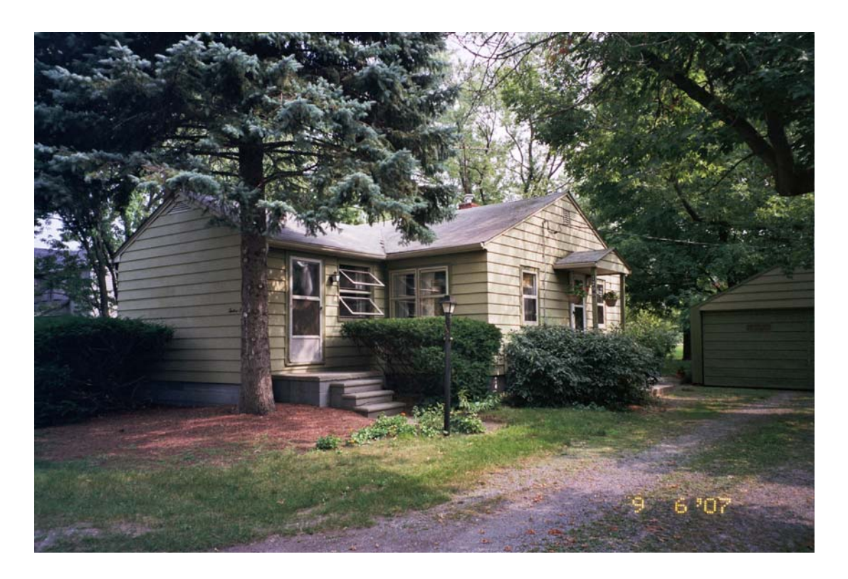
Photo 1. George K. Holtz House, 1290 E. Auburn Road, looking southeast.