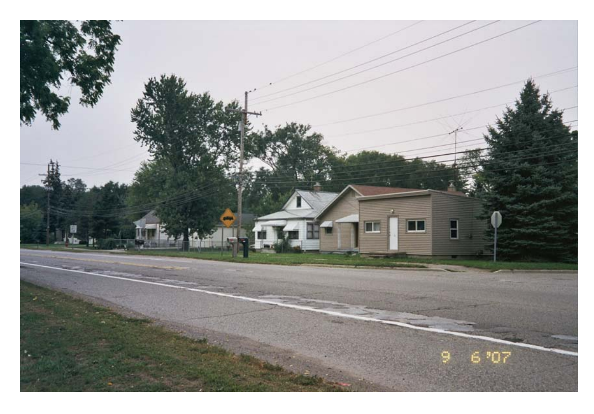
Photo 10. North side of East Auburn Road, looking northwest from in front of Ray Frank House.