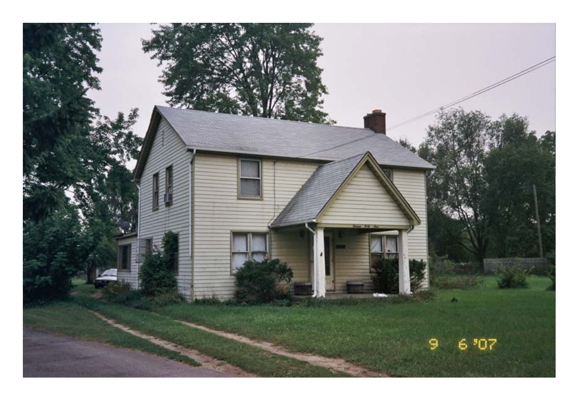
Photo 3. Loren B. Frank House, 1344 E. Auburn Road, looking southwest.