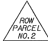
EXHIBIT "A" 15-05-351-006 1010 ADAMS ROAD